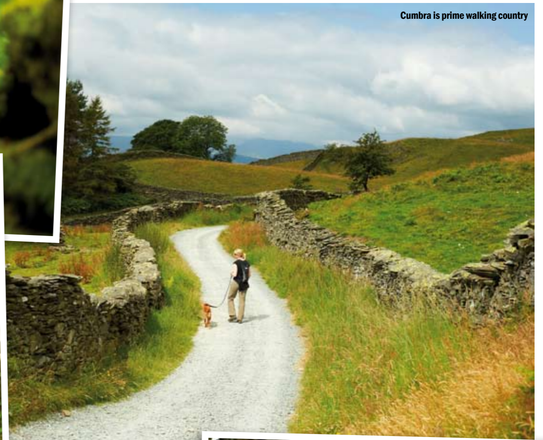
Cumbria is prime walking country