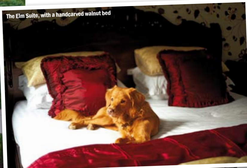
The Elm Suite, with a handcarved walnut bed