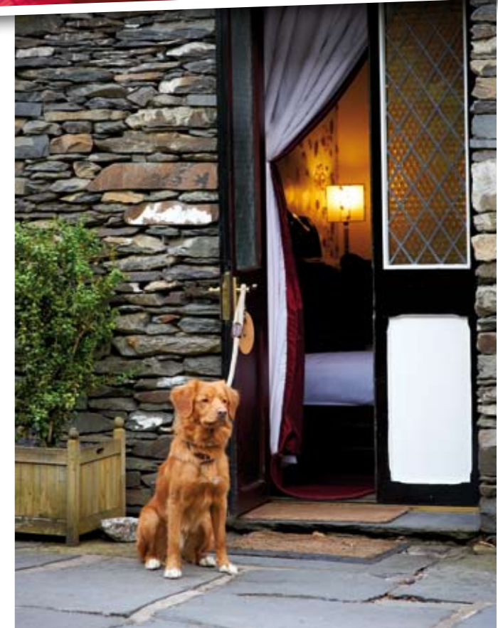
Broadoaks has an enviable location