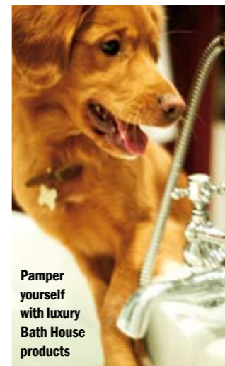
Pamper yourself with luxury Bath House products

Obviously, with so many canine guests, there have to be a few house rules but, made by the resident cockapoo Molly, they're pretty simple. Well-behaved dogs are welcome but, if you make a mess, there's a mop under the stairs! The hotel's dog-friendly approach is working because dogs were a common sight in the Lounge and Music Room where they sat while their owners relaxed with the papers or a enjoyed a drink beside the fire. In fact, the